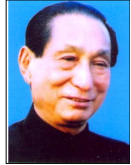
Dr. S. C. JAMIR Governor, Odisha