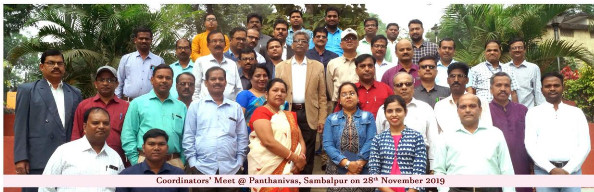
Coordinators' Meet @ Panthanivas, Sambalpur on 28 th November 2019