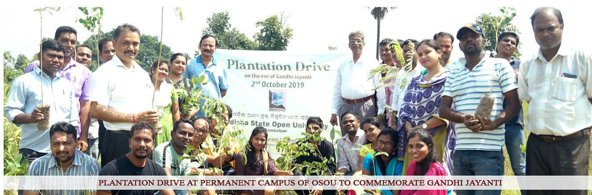
PLANTATION DRIVE AT PERMANENT CAMPUS OF OSOU TO COMMEMORATE GANDHI JAYANTI