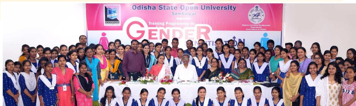
One Day Training Programme on Gender Sensitisation organised by Odisha State Open University, Sambalpur supported by Women and Child Development Department, Government of Odisha