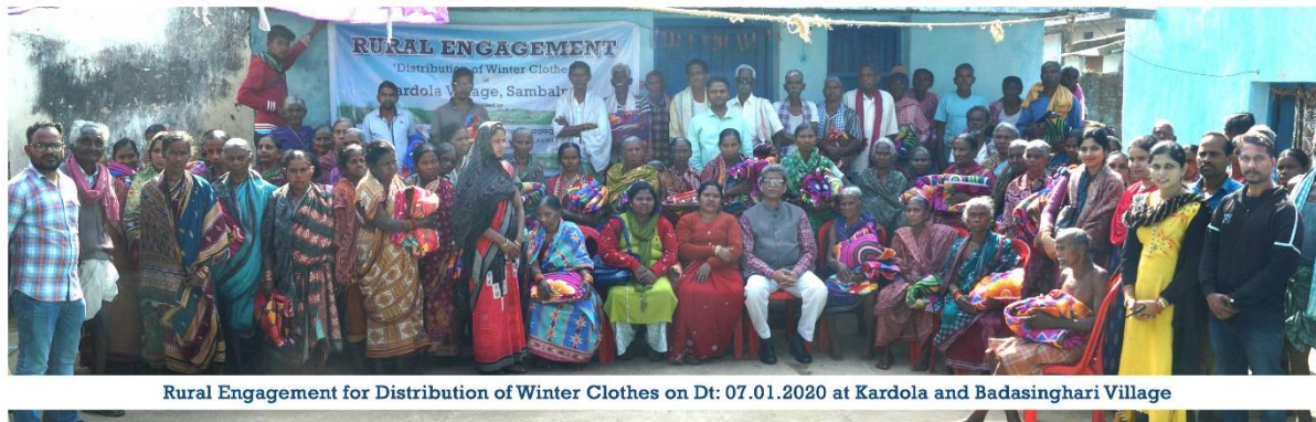
Rural Engagement for Distribution of Winter Clothes on Dt: 07.01.2020 at Kardola and Badasinghari Village